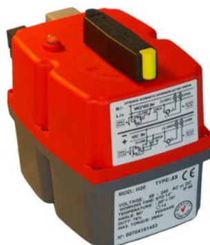
The J3 - H20 quarter turn electric valve actuator

Visual indication of the actuator's operating status is constantly shown by a highly visible LED light.