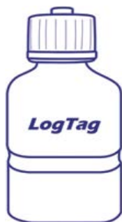
Glycol Buffer Not Included