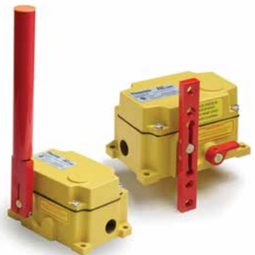
Improved ROS & SPS Versions

These conveyor protection switches utilize a rugged heavy duty design. They are built to last, providing many years of dependable service. The modular design of the base unit provides added convenience for installation and maintenance. Numerous options allow you to pick the right switch to fit your applications. Use the conveyor protection switches to protect your business in even the most challenging applications.