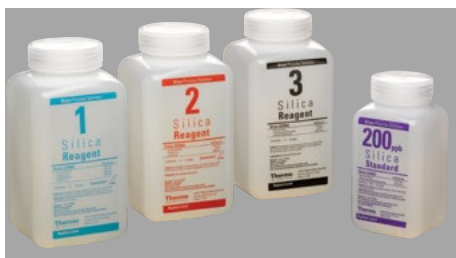
Reagents and standards

We work closely with you to define your needs, and ensure you are using the analyzer in a way that improves your bottom line. For more information, contact your local water quality specialists.