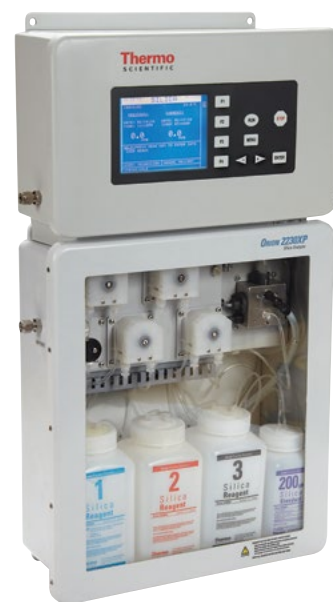
Orion 2230XP Silica Analyzer