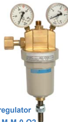
Manifold pressure regulator U13 M-200-20-M24f-M-M-0-O2