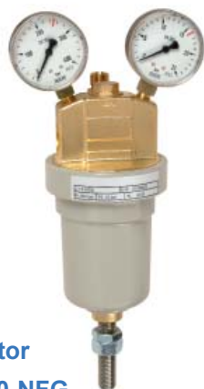
Line pressure regulator U13 P-200-16-0-M-M-0-NFG