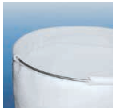
SNAP-RING seal ring