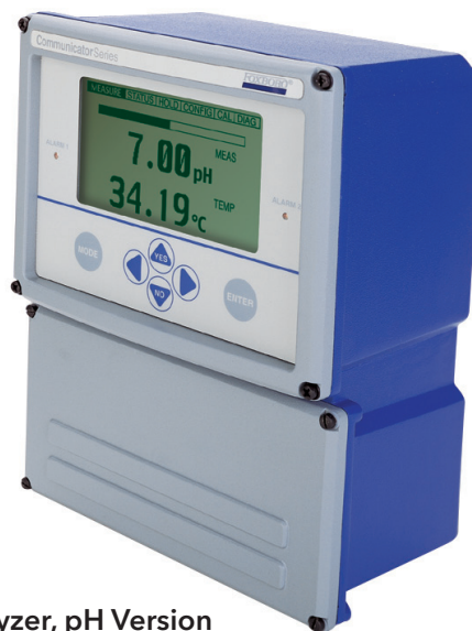
875 Analyzer, pH Version