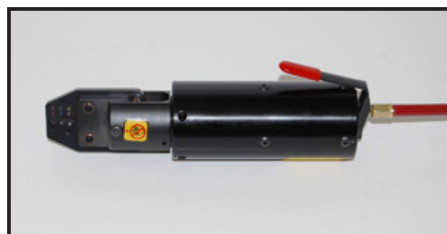
PMT232 Pneumatic Tool