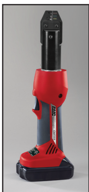
GMT232B Battery Tool

Battery and Pneumatic Powered Versions are Available!