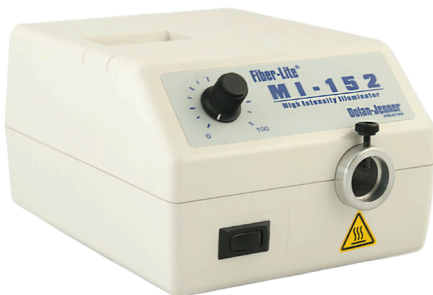
Mi-152 25mm Fiber Interface Accepts all DJ Fibers & Adapters