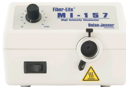
Mi-157 Manual Iris for Precise Color Control