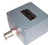
P/N B13-021, ATEX, high temperature housing