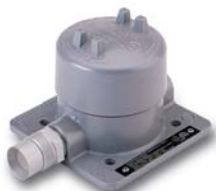
P/N 10252-1, CSA, explosion-proof housing