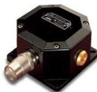
P/N B13-020, ATEX, polyester housing