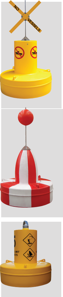
Available in a range of IALA colours and configurations, optional mould-in graphics and with a wide range of IALA recommended top marks