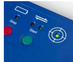
DATAPAQ ET3 SmartPac*