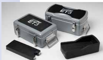
ET3 Barriers TB0253 & TB0263