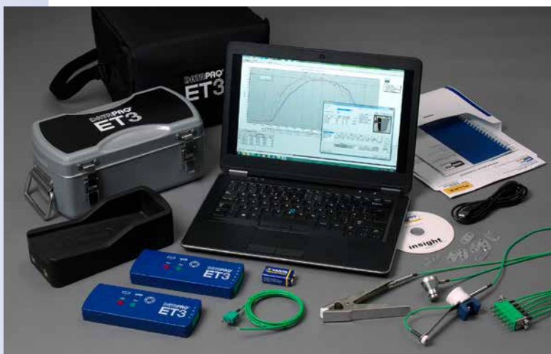
DATAPAQ EasyTrack3 Professional system

DATA PAQ ET3 Datalogger Available with 4 and 6 Channels