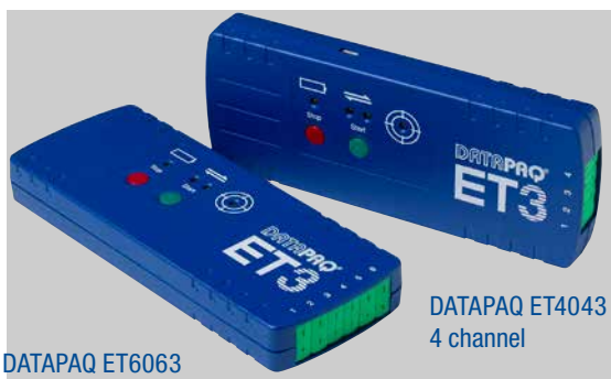
DATAPAQ ET6063 6 channel

DATAPAQ EasyTrack3 is the latest generation of Oven Tracker systems in the EasyTrack family. Built on the pedigree of EasyTrack & EasyTrack2, the new system continues to provide the market with the easiest, robust, powerful oven profiling tool available to custom coaters, OEM operations or coating suppliers alike.