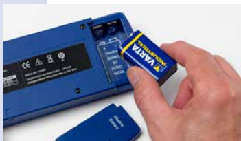
ET3 logger – replaceable battery