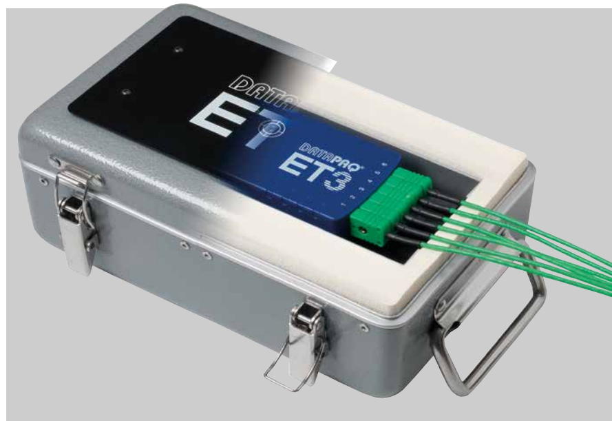
DATAPAQ EasyTrack3 system with standard TB0253 thermal barrier