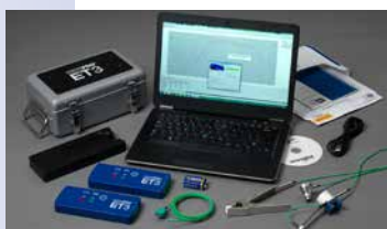
EasyTrack3 STD/ADV system