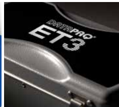
Thermal barrier DATAPAQ TB0263*