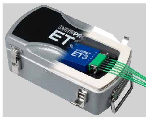
EasyTrack3 Professional System operational