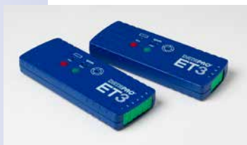
ET3 Loggers ET4043 & ET6063