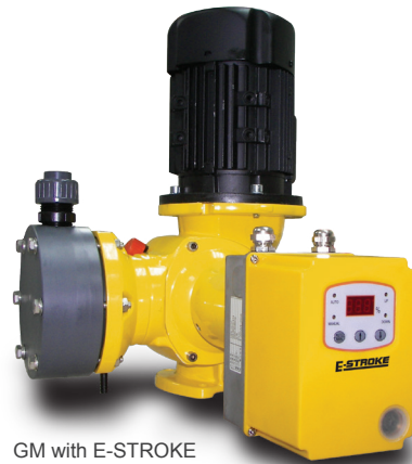
GM with E-STROKE electrical capacity controller