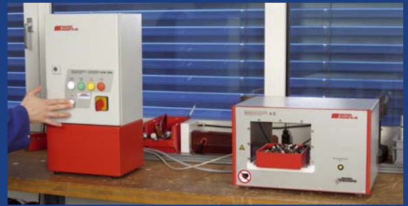
Activation at the required distance.