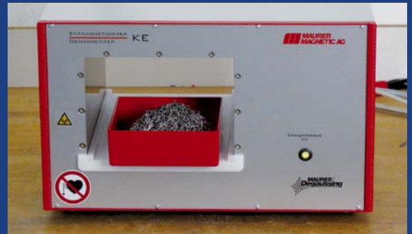
The parts get demagnetized within a few seconds by the demagnetizing pulse.