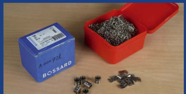
Increase in productivity by demagnetizing multiple pieces concurrently.