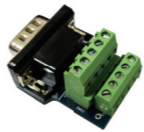
HMB-CER-018 Converter (For 7" models and above) (RS232 / RS422 / RS485)