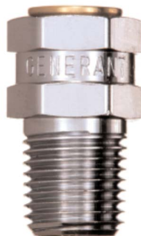
VRV Vent to Atmosphere

(based on sealing selection, see ordering information)