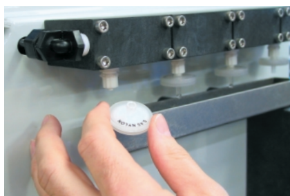
The EZ SDI™ uses standard disposable filter cartridges.

Continuous Sample Flow - The EZ SDI™ is designed for permanent installation. In order to prevent stagnant conditions in the sample line, the monitor continuously allows a side stream of sample to flow through the monitor up to the point where the sample enters the filter. A specially designed orifice controls the rate of this side-stream flow. The orientation of the flow control orifice also allows air in the sample line to be separated from the sample before the sample enters the filter holder.